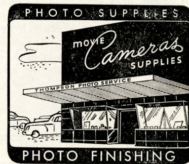
PHOTO FINISHING THOMPSON PHOTO SERVICE