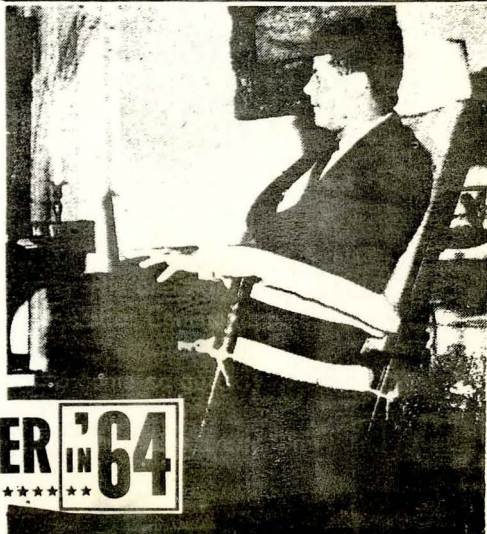
PRESIDENT JOHN F. KENNEDY, 1963